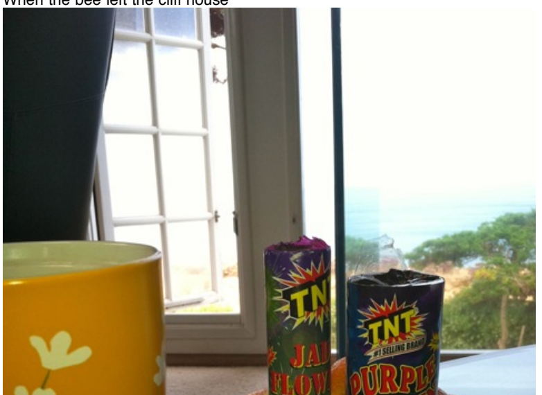
When the bee left the cliff house

Not to mention if the organic farms in the study are close to non-organic farms to hire an out of work elementary school kid no less than 2 years away from entering high school to plot a graph showing if there is any correlation with the data coming from organic farms not close to non-organic farms.