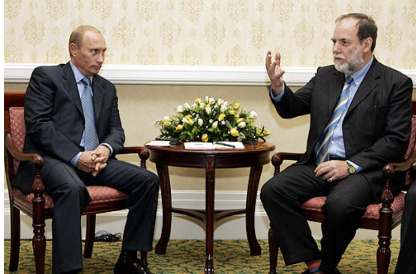
ive taken a snapshot of De Beers wikipedia so should everyone. [CLICK HERE]