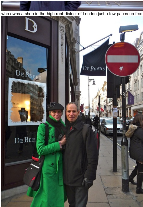
who owns a shop in the high rent district of London just a few paces up from De Beers' flagship operation located at 50 Bond Street,