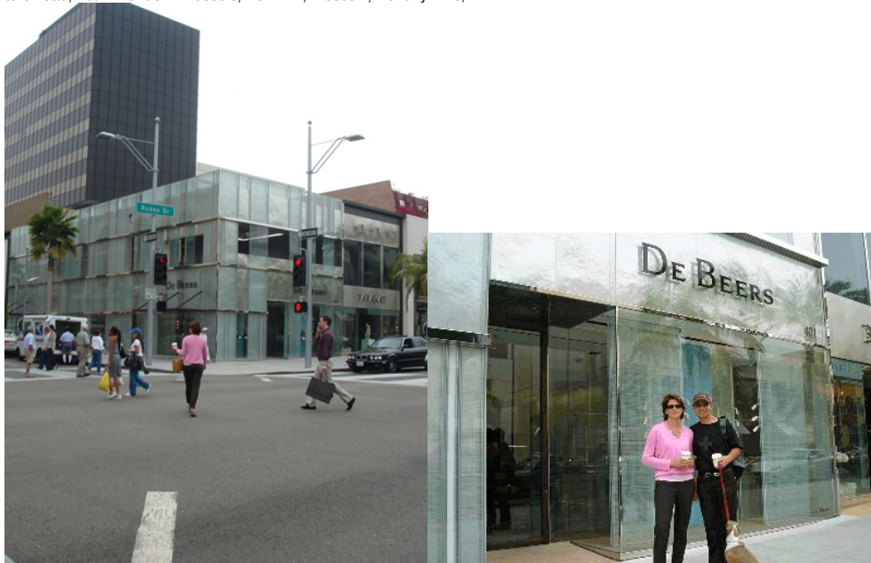
Johannesburg etc etc, but on 47th Street New York City, nearly $14 billion worth of diamonds, that in the next instant wipes out all those dollars, at least from the mainland of the US, while Putin puts those $$ to work in Russia and Leviev takes his $1.5 billion commission and becomes not only charitable in faraway places like Israel, where bribing government officials is as common place as anywhere, but Leviev makes a big splash when buying the New York Times building in New York City just up from 47th Street which is the money laundering and intelligence capital of the world for De Beers; and in the process props up the real estate of the rich who go to the banks to get more money to buy more real estate, and just so long as the